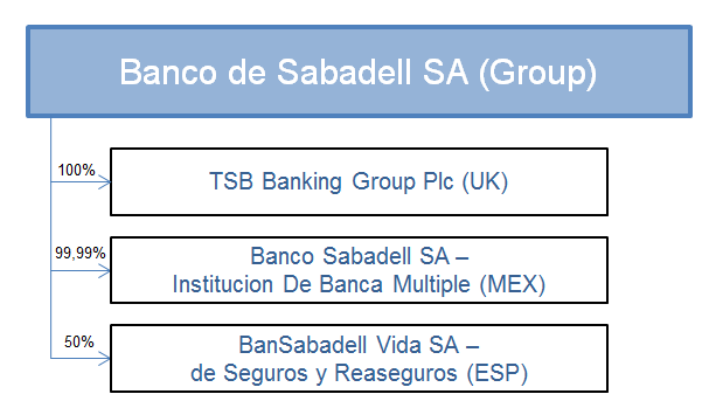
Chart 1: Main subsidiaries and investments of Sabadell | Source: Own presentation based on Annual Report 2019 of Sabadell